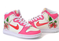
Air Max 2010 men green black ID:5872 Free Shipping